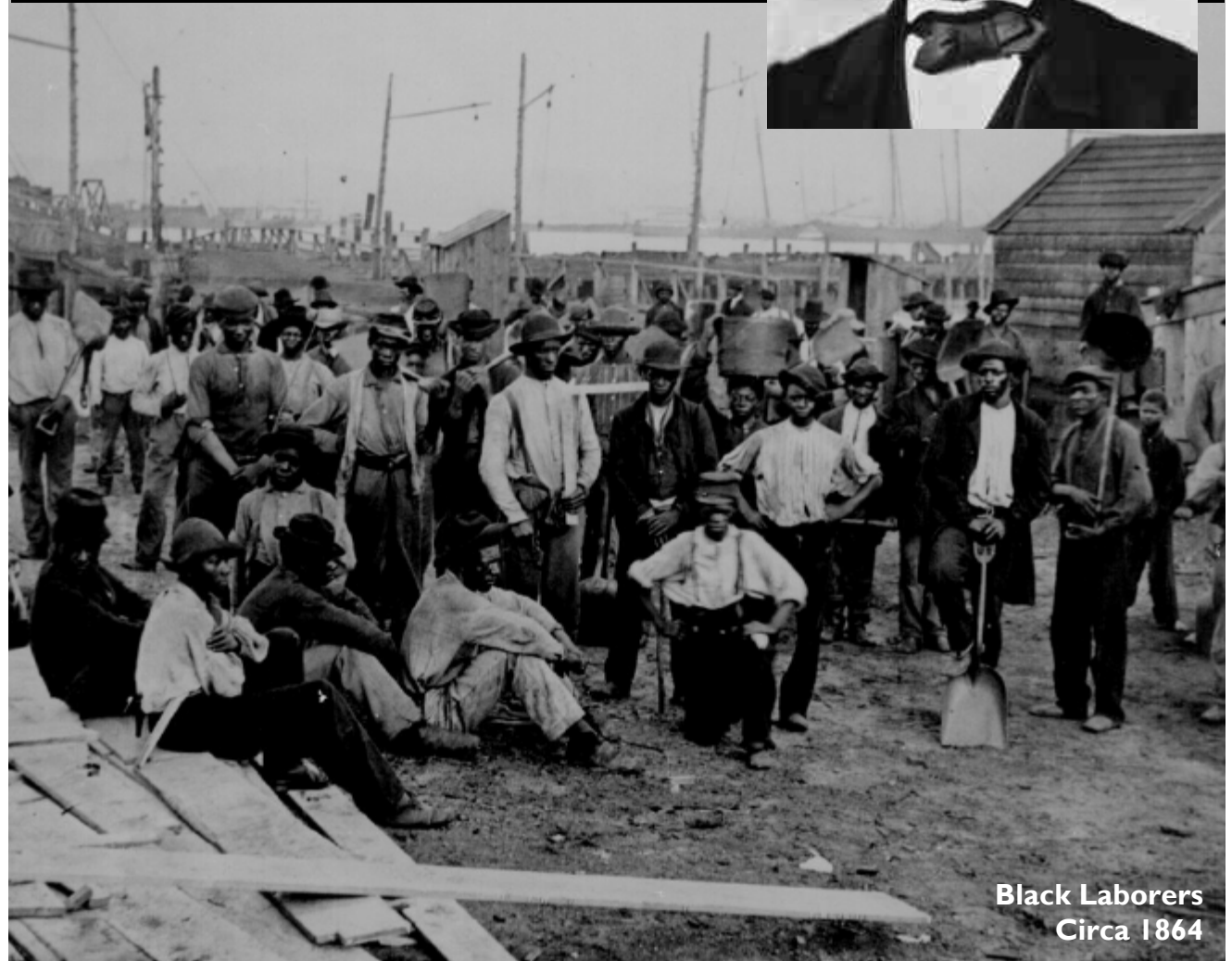
Black Laborers Circa 1864