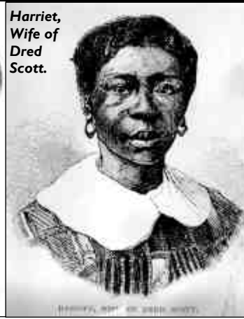
Harriet, Wife of Dred Scott.