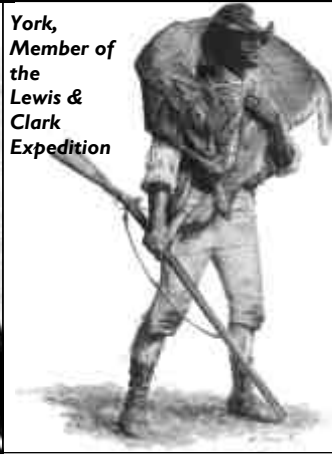
York, Member of the Lewis & Clark Expedition