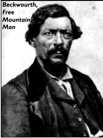
Beckwourth, Free Mountain Man